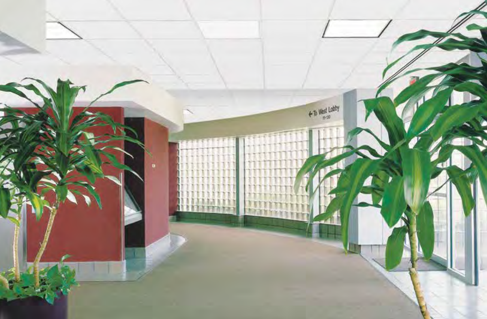
Sand Micro™ Reveal (SHM-154)